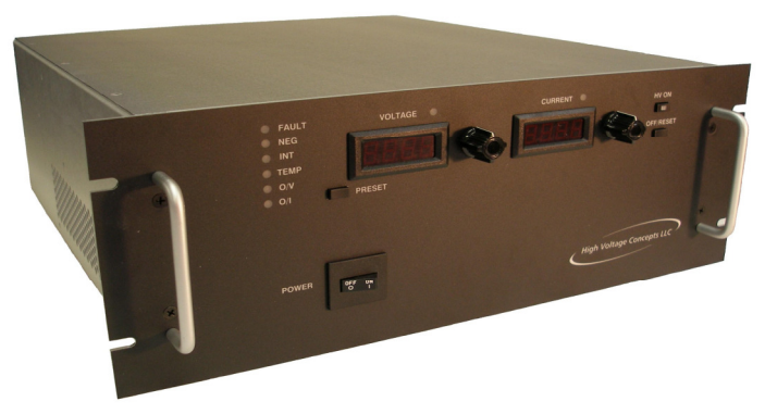
HVCS-3K in 7" Chassis