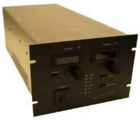
HVCSH-6 in Half Rack