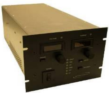
HVCSH-6 Shown in Half Rack