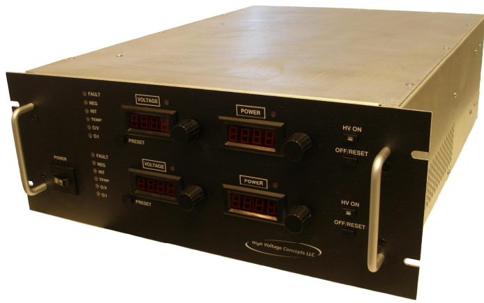
HVCS-6-2X Dual Sputtering Shown in 7" Chassis